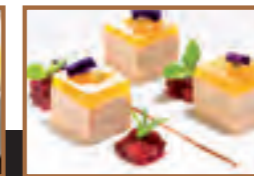
Foie Gras with citrus fruits